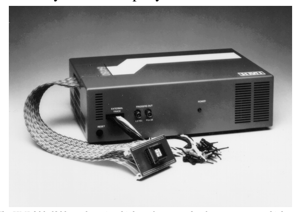
The HMI-200-6809 emulator is a high performance development system which combines the control of an in-circuit emulator with the power of a logic analyzer to provide a complete debugging environment for hardware and software.

with the HMI-200-6809! Combined with SourceGate II, HMI's acclaimed source-level debugger, the HMI-200-6809 provides the industry's most powerful debugging tool for the 6809. Of course, you would expect nothing less from the company that provides the best development tools in the industry. That company is HMI!