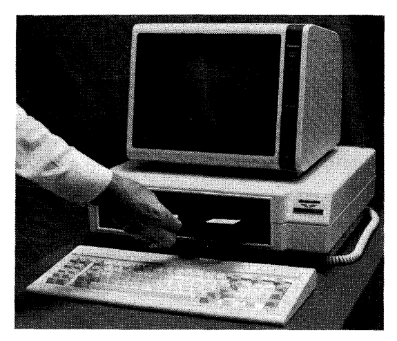
Inserting A Diskette Into The DIMENSION 68000